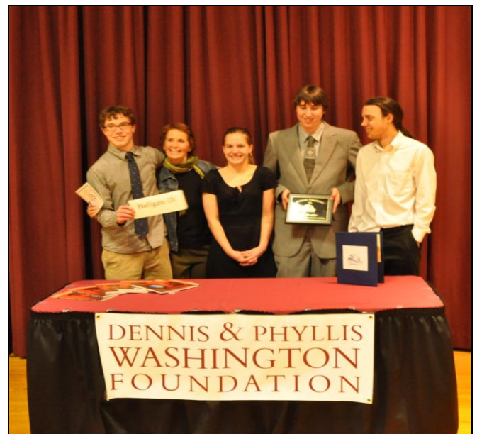
Winning Hellgate team places 9 th in national competition