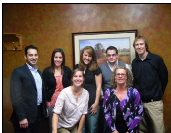
Fall 2010 interns

NON-PROFIT ORG US POSTAGE PD MISSOULA, MT PERMIT #569